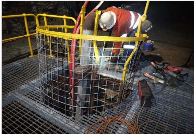
FIGURE 4 - SILVER SWAN ESCAPEWAY LADDER REFURBISHMENT PROGRAM

Post the completion of the July 2018 Study the Company has completed a number of pre-production works including underground escapeway refurbishment/replacement (refer Figure 4), refurbishment of certain underground infrastructure including the southern vent rise fan, pumping stations, electrical infrastructure, decline rehabilitation (ground support and services) and various safety works in and around the process plant (refer Figure 5). These works will assist in fast tracking development of the underground mining operations and the concentrator refurbishment.