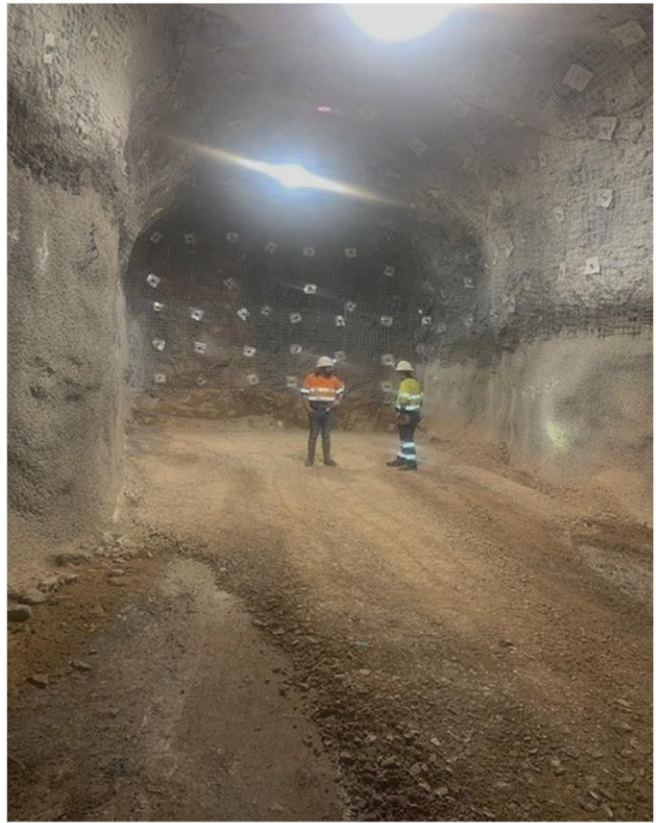
FIGURE 2: GOLDEN SWAN DRILL DRIVE