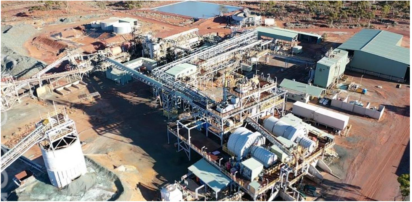
FIGURE 1 – BLACK SWAN 2MTPA PROCESSING PLANT

The following work streams have already been completed: